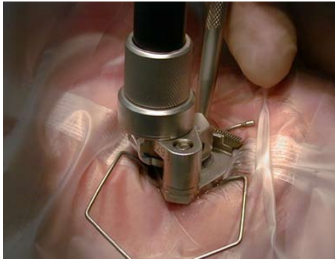
Microkeratome placed on eye

A suction ring placed on your eye lifts and flattens the cornea and prevents your eye from moving. You may feel pressure from the eyelid holder and suction ring, similar to a finger pressed firmly on your eyelid. From the time the suction ring is placed on your eye until it is removed, vision appears dim or goes black.